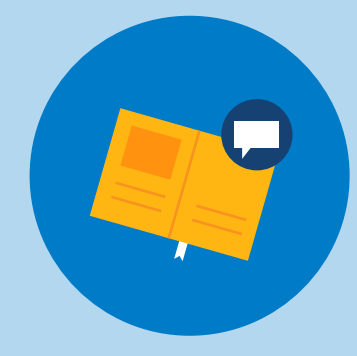
Communication & education