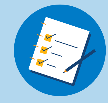
Only registered in the internal administration