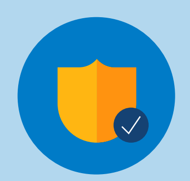
Ultimately responsible for safety of all GMO activities

The legal entity, also referred to as user or license holder, is ultimately responsible for the safety of all activities involving GMOs inside the organization.