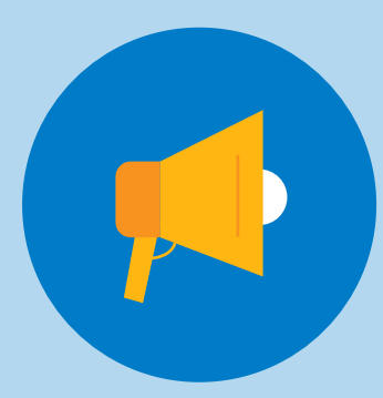
Point of contact for colleagues & the GMO Office